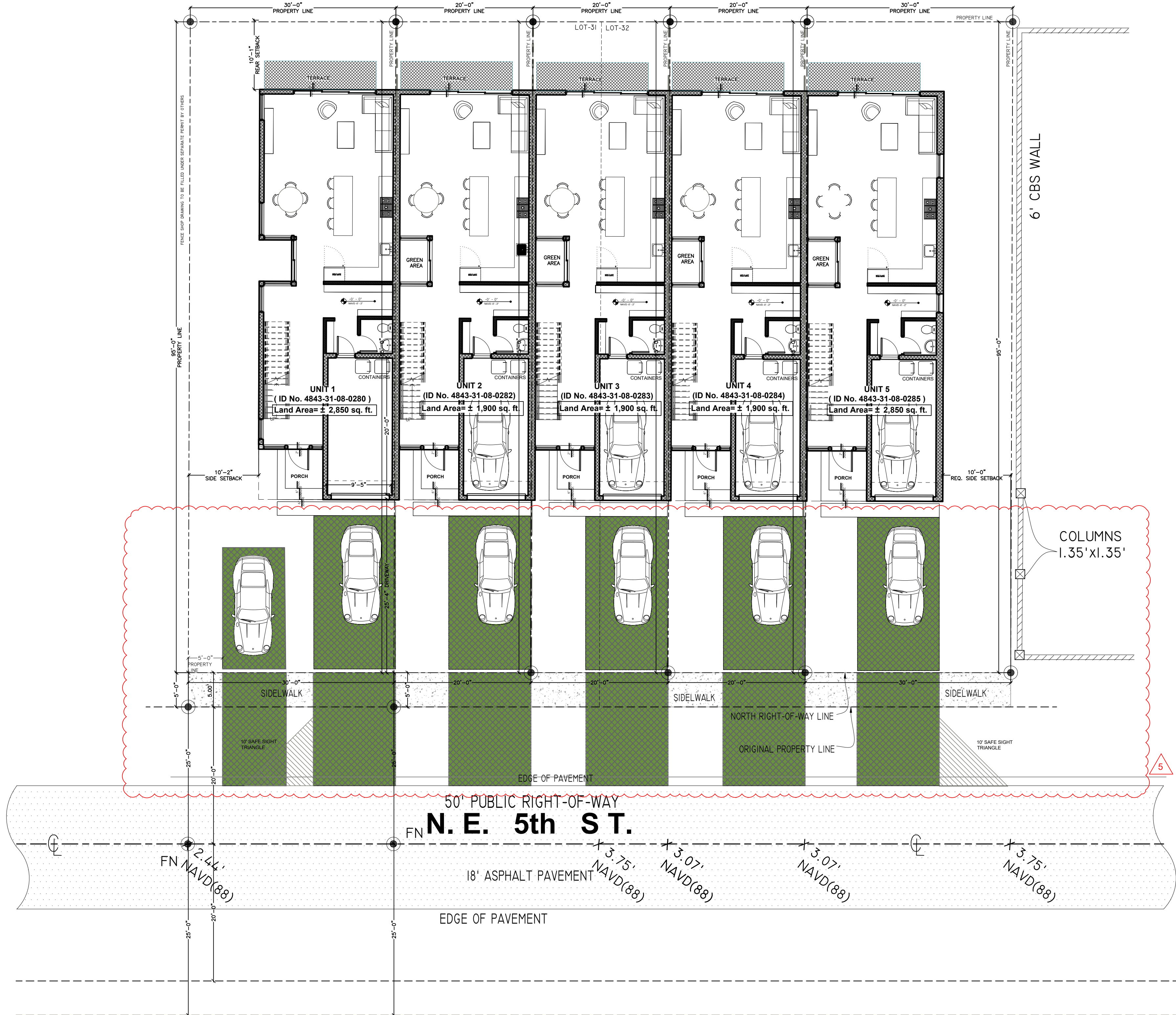
1 SITE PLAN 1/8" = 1'-0"